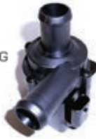
VAG group various models - Audi, Skoda & VW