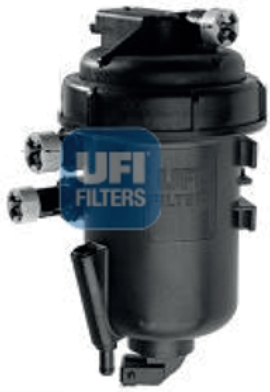
Various Vauxhall 1.3 & 1.9 CDTi Engines - 2013