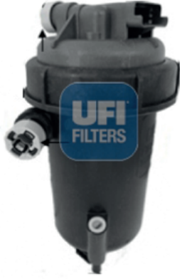
Fiat Ducato Multijet 2.3 - 2014 -